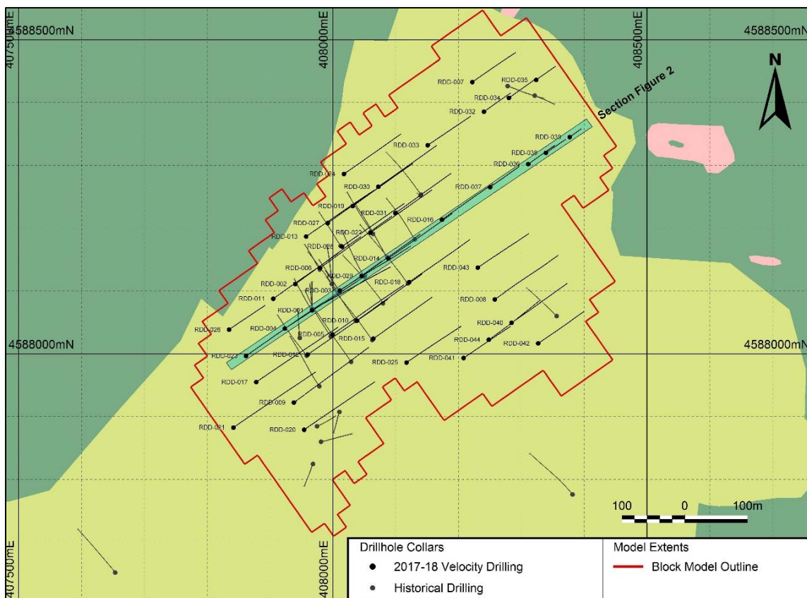
Figure 1. Plan view of Inferred Resource extents relative to angled drill hole dataset.

“We are a little over half-way through our planned drilling at Rozino, which will bring us to a planned PEA later in 2018. On completion of the PEA, the Company will earn a 70% stake in the Project. The results of this resource are excellent and keep us on track to deliver our PEA within one year of the drill start,” stated Stuart Mills, Velocity’s Vice-President Exploration. “Having started drilling in late July 2017, we have moved quickly to get to this interim resource estimate in just over 7 months. Our stated objective has always been to define potentially open-pittable resources and defining 90% of resources within 110m of surface is consistent with that goal.”