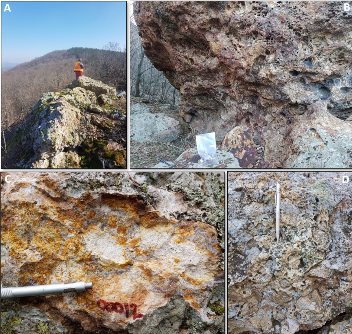
Figure 2: Selection of rocks outcropping at Obichnik. A. Ledge of sub-vertical surface oxidized quartz-sericite-pyrite (QSP) alteration. B. QSP structurally controlled replacement body with oxidized, steep, sheeted, quartz-pyrite veinlets. C. QSP altered volcanic fragmental. D. Siliceous hydrothermal breccia developed within volcanic fragmental.

diamond drill holes for 1,017m, and a Historical Resource estimation which was registered with the Bulgarian State.